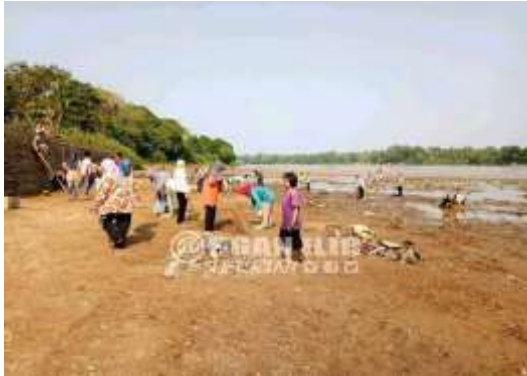
Figure 2.6 Mutual cooperation

From the results of interviews, the Sungai Pinang community held mutual cooperation to clean Supi beach from rubbish and dirt. This was carried out periodically to ensure that Supi beach remained clean to maintain the comfort of tourists and several communities formed waste management teams to collect rubbish in a more organized manner.