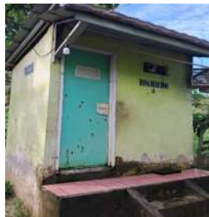
Figure 2.4 Toilet

The picture above shows the condition of Supi Beach. Supi Beach is a charming beach surrounded by clear water that gives a natural impression. There is also a toilet at Supi Beach, a small building located not far from the beach.