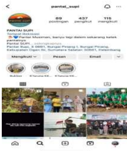
Figure 2.7 Social media

Promotion of Supi Beach is via social media and the promotion is very effective and connected to the audience provided by Instagram and Facebook.