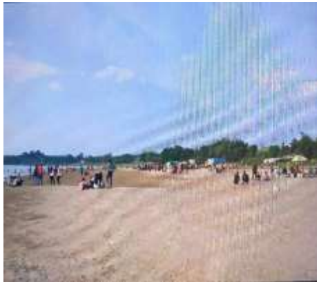
Figure 2.5 Supi beach

Supi beach helps improve their family's economy, creates jobs and is also a place to rent equipment for the beach such as barges. or tires for swimming.