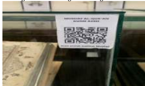
Figure 4 Mushaf digitized using a barcode