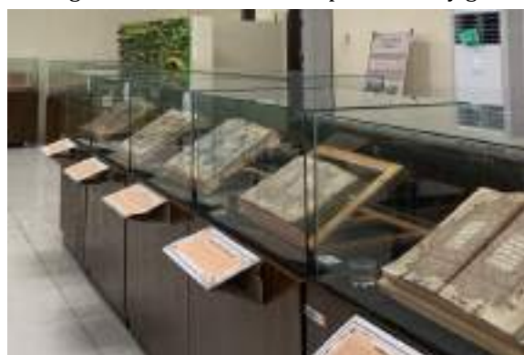
Figure 3 Mushaf collection protected by glass

Over time, the water will run out and must be refilled again. In addition, in each glass box there is Silica Gel which functions to prevent termites from coming. Light also affects preservation efforts. Light can come from natural sources (sun) or artificial sources (lamps).