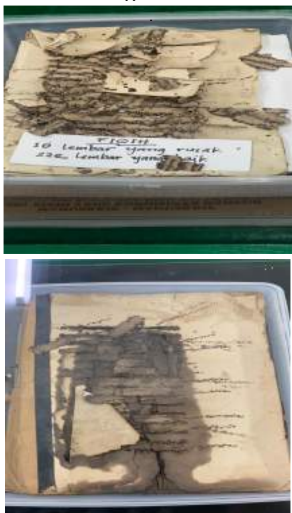
Figure 8. Mushaf that has been torn because of the type of ink