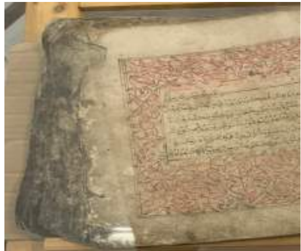
Figure 7. Black spots on handwritten Al-Qur'an Mushaf

In addition to ink streaks, there are also black spots and black stains on the paper. This damage is caused by dry water, insect droppings such as cockroaches that stick and dry on the paper, and can also be caused by aging paper making it difficult to read.