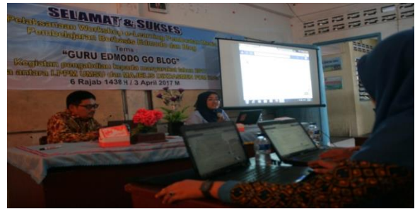
Figure 3. Material Presentation About Edmodo and Blog

innovate new method and media in learning in order to maximize learning outcomes.