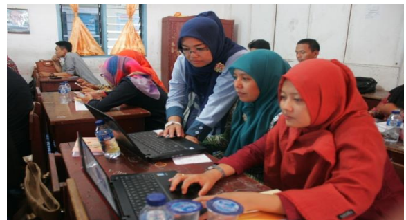
Figure 4. The Direct Practice Session

The second method was discussion which was used as a medium of communication during the course of the training. Teacher and trainer can communicate to each other. There was also a question session which was used to confirm if there was something not understood related to the material delivered during the training. Last, there was a direct practice methods implemented to ensure that science and technology has been transferred to all participants in accordance with the program purposes and targets. All of the session was conducted by supervision from the mentor.