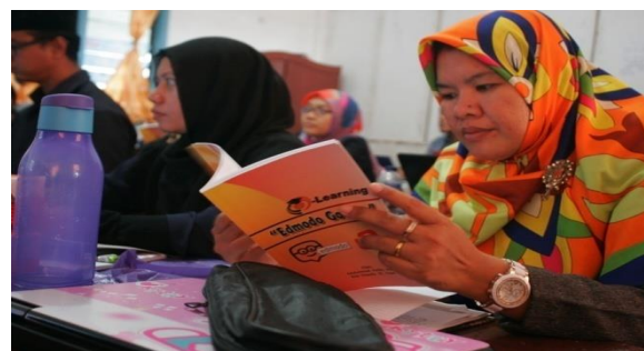
Figure 5. Participant is Reading the Handbook during the Training

As one of the solution to overcome this, team already prepared a handbook that can be used by the participant as their guidance. By following the explanation of step by step process of applying Edmodo and Blog as the IT-based media in teaching and learning from the book, and also assisted by the mentor during the training, all of the participants can follow the training program more easily. Later, the handbook is one of the other outputs of this Science and Technology Program for the Community Service (IbM).