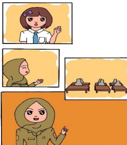
Figure 2. Chemic Media After The Stage of Adding Illustration and Coloring