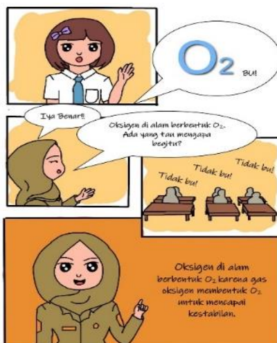
Figure 3. Chemic Media After the Text Addition Stage