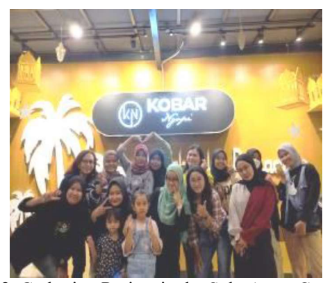
Figure 3. Gathering Project in the Solo Army Community

The informant's statement above explains that as long as a member in the Solo Army community, chat, or direct communication is smooth, there is no problem; it shows that K-Popers also attach importance to shared principles. It can be seen from the Solo Army community that actively carries out activities or events such as gatherings or K-Popers associations that aim to connect friendships and strengthen community solidarity despite the age gap, but that does not prevent them from uniting. An example of the interaction of members of the Solo Army Community is shown below.