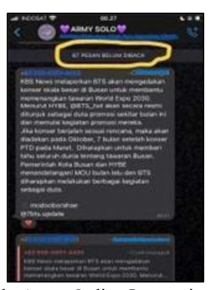
Figure 4. K-Popers Solo Army Online Interaction through Whatsapp Groups

Figure 3 shows that the gathering project is a meeting of community members that aims to establish friendship and strengthen solidarity between admins and admins, admins with members, and members with members. The activity is usually held regularly every three months so that their interaction and communication are more established. Unfortunately, many members could not attend due to conflicts with personal matters, but that did not dampen their enthusiasm to interact and establish communication. The meeting place constantly changes according to the agreement because they still need to get a basecamp or secretariat. At this event, the activities were watching BTS videos, singing, and playing games. The Solo Army community interaction is also actively carried out through online WhatsApp groups, as shown in Figure 4 below.