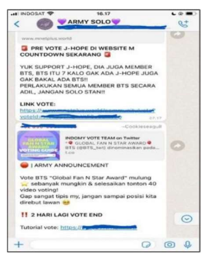
Figure 1. Fanaticism of K-Popers Solo Army via Whatsapp Group

Informant F.1's statement is also in line with informant F.5, who stated: "Usually, through social media, sis, for example, I continue to support them on their accounts, such as Instagram, Twitter or I participate in voting to win the Award event".