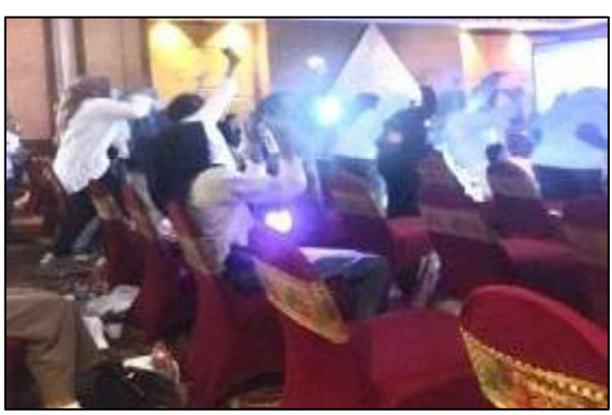
Figure 3. K-Popers Solo Army Fanaticism at the Online Nobar Concert Event