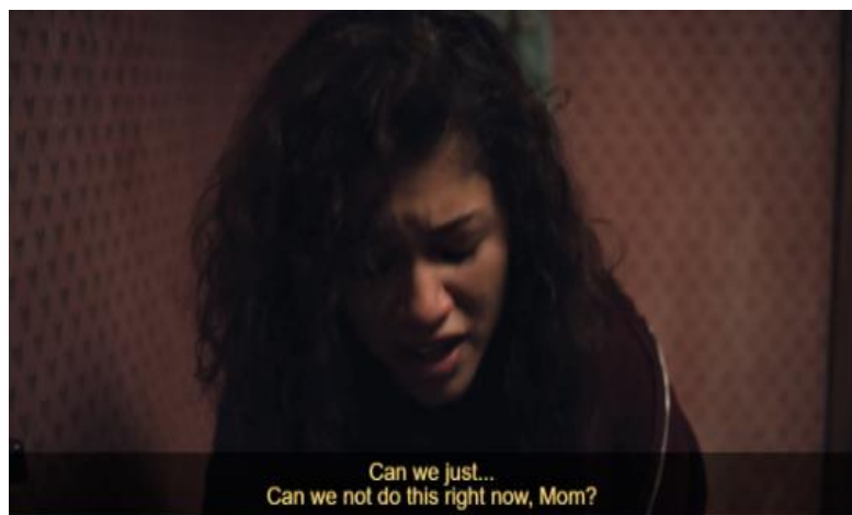
Data 2.1 Ego/Rue's Guilty