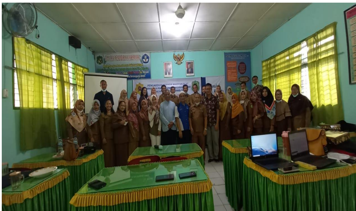
Fig. 3. Photos with the Team and Activity Participants.

After the material was delivered by the team, the participants were also taught to use IT better. Even though during the Covid-19 Pandemic, teachers teach with an online system and there is nothing wrong with this training, they are still trained in the use of IT. After the Covid-19 Pandemic and many teachers have done face-to-face learning but do not turn their backs on technology, in fact technology must be further improved. The Government's policies on learning make all Teachers hone their skills at all times so as not to be left behind. The participants were even more enthusiastic when the training was carried out using IT, and it was also seen that the participants were preparing their media in the form of laptops and smartphones. At the end of the session, the participants were given the opportunity to ask questions and answers about activities and learning activities that were carried out after the Covid-19 Pandemic. After the question and answer session was carried out, the activity was completed. The community service activity team evaluated by communicating to the School about how teachers would improve their performance after this training activity and a photo was taken with the activity team with all participants who were teachers at SMP Negeri 15 Medan.