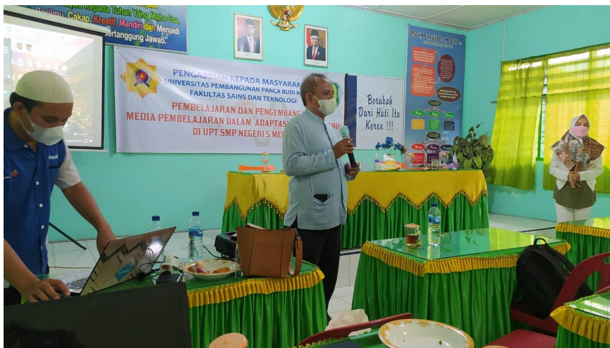
Fig. 2. PKM Activity Team is Presenting Material.

Blended learning is a learning method that combines two learning patterns, namely by utilizing technology and learning through teaching staff. It can be concluded that the pattern in the blended learning method concept uses a combination of conventional methods and utilizes the development of information technology. From the concept of mixing patterns in the learning method is the mixing of learning that is carried out conventionally with online classes which are expected by all students to be able to be active by finding a way of learning that suits themselves, and the teacher plays a role in making the classroom atmosphere orderly, not boring, and empowering students to establish an activity that builds facilities and infrastructure in knowledge for each student. With the blended learning method, it can increase the quality and capacity of the amount in learning, because of the combination of technology and human interaction so as to develop learning [7].