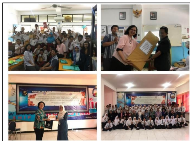
Fig. 3. Documentation of giving gifts at the end of the session of the community service activities carried out at SDN Keputih 245 Surabaya (upper) and SMPN 19 Surabaya (lower)

At the end session of the activity, the committee gave gifts to the students as well as souvenirs to the school, including the DAGUSIBU comic, so that later it could be used by the school and also understood further by the students (Figure 3).