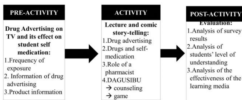
Fig. 1. The stages of implementing community service activities.

To evaluate the level of success of the activity program, an analysis of the understanding of the material was carried out by participants using a pre-and post-test model. The pre-test was given before the material was delivered, and after the activity, a post-test was conducted. The results of the pre-and post-test were then analyzed quantitatively.