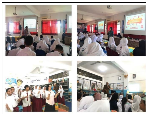
Fig. 2. Documentation of the implementation of community service activities, in the session of giving lecture presentation and DAGUSIBU dance, which was carried out at SMPN 19 Surabaya (upper) and SDN Keputih 245 Surabaya (lower).

In addition, the material on DAGUSIBU was also presented on how to obtain, store, use, and dispose of drugs. The material for DAGUSIBU is given with an outreach method using comics. In addition, for activities carried out in elementary school, students were also invited to do DAGUSIBU dance, with the hope that through the physical activity, they could better understand the material presented, as shown in Figure 2.