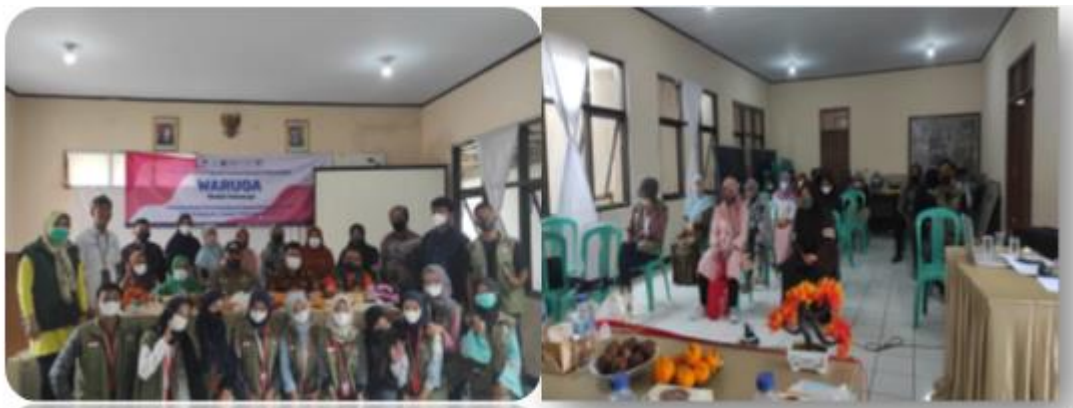
Gambar 1. Opening Session of the implementation of Social Entrepreneurship Training activities of Pejuang Muda of Sukabumi City

This training activity began with an opening ceremony which was attended by the City Government, community leaders, local religious leaders and all social mobilizing stakeholders in Sukabumi City (Figure 1). There were some welcoming speeches in this session.