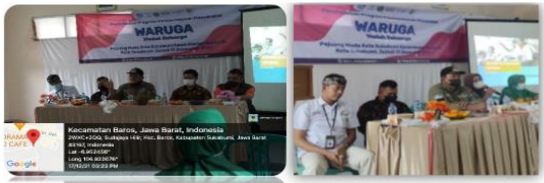
Figure 2. Speeches in the Opening Session of the implementation of Social Entrepreneurship Training activities of Pejuang Muda of Sukabumi City

The speakers also motivated the participants to be able to apply the results of the training in their real lives. Participants were expected to be more creative and took advantage of existing business opportunities as a result of the training activities.