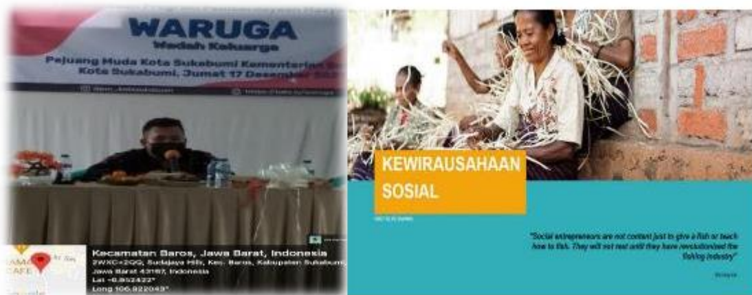
Gambar 3. The Presentation of Social Entrepreneurship

The speaker also explained about the goals of social entrepreneurship, the characteristics of social entrepreneurs, steps to build social entrepreneurship and examples of social entrepreneurship.