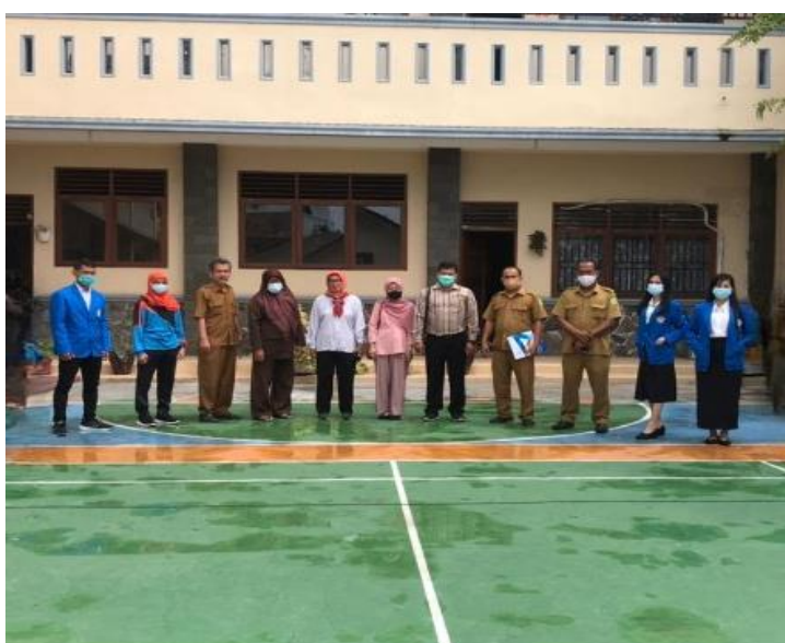
Fig. 3. Closing activity with Principal and participants

The closing activity was filled with hospitality and impressions as well as suggestions from participants during this community service activity to improve the next activity. The Organizing Committee and Presenters motivate the participants to continue learning and improve their competence, both individually and groups. It was expected that schools, especially teachers can implement and improve the knowledge that they got from this activity.