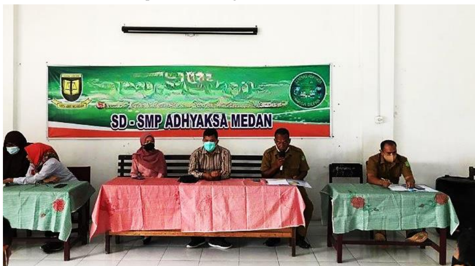
Fig. 1. Opening Socialization JCRS (Journal of Community Research and Service),6(1), 2022

There were 3 steps in implementing the socialization in SD Adhyaksa Medan. This service activity was started by preparation of activities in which participant forms to partner teachers and socialization activities were distributed. The purpose of this activity is to provide information on the agenda of activities, the objectives of implementing the activities and seeking agreement on the schedule. The socialization was attended by 20 (twenty) teachers. The activity was opened by the Principal and the Implementing Committee. It also carried out the submission of practice questions along with discussions that were practiced during socialization.