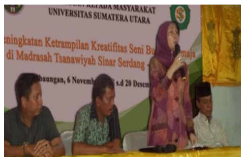
Picture 1. Opening Ceremony.

Through lecturing, practicing, and performing the creativity skills of dance, pantun reciting and theater in the school, the community service team has contributed socially and culturally. In the lecturing program on “Understanding and Mastering Verbal and Intellectual Information about Malay art and theater”, the topic given by the teacher was “Respecting Traditional Culture”, that were rhyming arts, dance, and Malay theater arts.