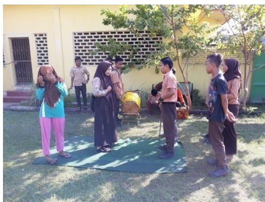
Picture 4. Students were doing a teamwork.