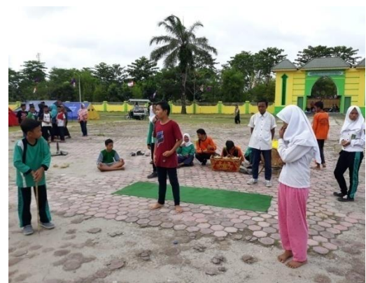
Picture 5 to 8. Practicing in the replica field of Istana Sultan Serdang – Serdang Bedagai .

Students were then asked to live the verbal expressions in Pantun which inherit the local wisdom of the Malay community to the young generation of Malay people. Some selected pantuns taken from the book “ Pantun dan Pepatah Melayu ” (Sinar, 2004) were learned continuously to get various rules and valuable philosophical background.