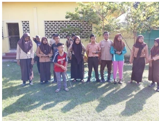
Picture 3. Students were listening to lecture.