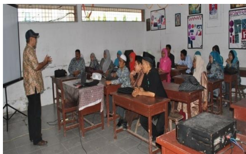
Picture 2. Briefing to the students’ parents.