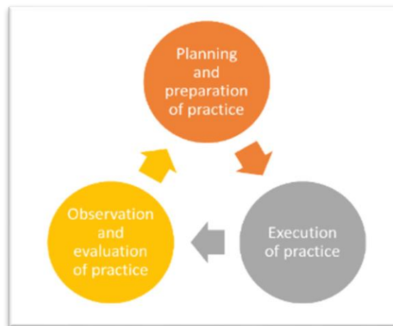
Figure 1. The three self-teaching dimensions by Jorgensen (2004)

As the reader might have noticed, the author has employed the terms “consciously”, “conscious” and “deliberate”, several times in the last paragraphs for, from his perspective, the successful achievement of musical goals will depend on the level of mindfulness exerted during the practice session as well as on the degree of authentic wanting to learn. In other words, the mere automatic implementation of effective practice strategies will represent the 50% of the work. The other 50% consists of the continuous awareness and reflection students must exercise throughout the practice session.