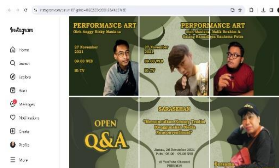
Figure 4. Perform Virtual Exhibition