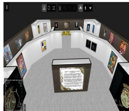
Figure 2. exhibition layout