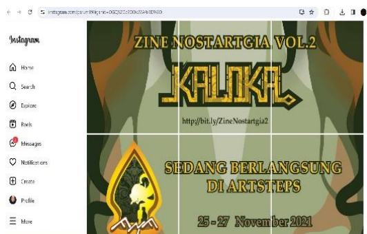
Figure 3. promotion of virtual exhibitions

As students who aim to hone their skills to be more critical in appreciating works of art, they can also access the performance art videos in the Instagram rules that have been distributed by the virtual exhibition committee. With the existence of Instagram rules for promotional events other than students, the public can also access virtual exhibitions that are held. The following are the rules on Instagram made by the virtual exhibition committee: