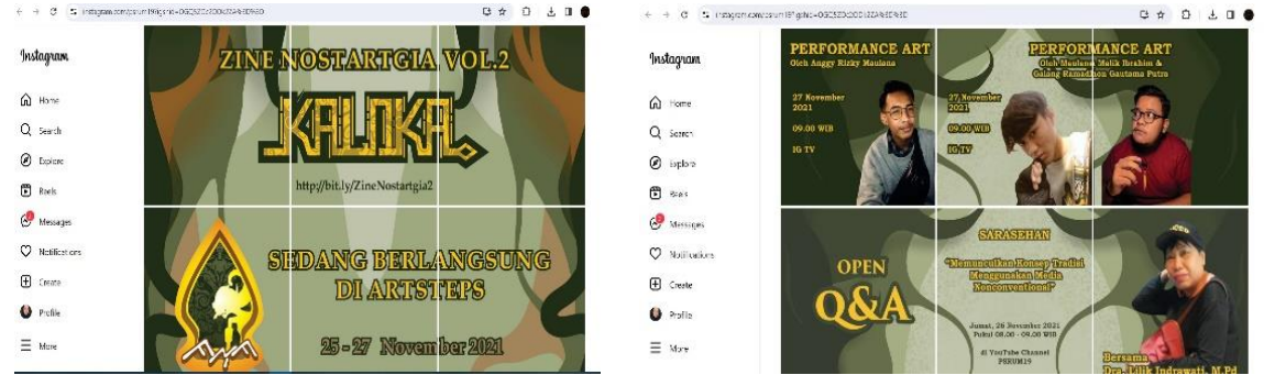
Figure 3. promotion of virtual exhibitions

As students who aim to hone their skills to be more critical in appreciating works of art, they can also access the performance art videos in the Instagram rules that have been distributed by the virtual exhibition committee. With the existence of Instagram rules for promotional events other than students, the public can also access virtual exhibitions that are held. The following are the rules on Instagram made by the virtual exhibition committee: