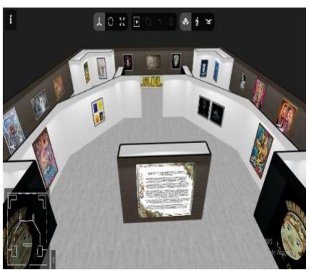
Figure 2. exhibition layout