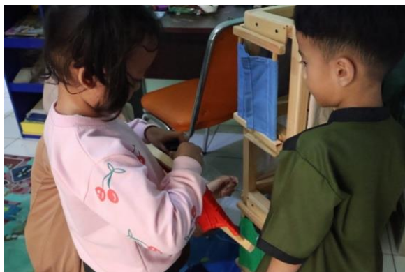
Figure 3. The Use of Dressing Frame with Rotating Shelf at Graha Ananda Kindergarten

The children at Graha Ananda Kindergarten showed a very positive response to the effectiveness of the rotating shelf design on the dressing frame. They responded enthusiastically and were happy to use the dressing frames available on the turnstile. In addition, the ease of accessibility provided by the rotating shelf design makes children more independent in picking up and storing the dressing frame without external assistance. This positive response can also be seen from their proud expressions when they successfully use the dressing frame and place it back easily on the shelves provided. Overall, the observation results show that the availability of well-organized dressing frames and the children's positive response to the rotating shelf design implies that this approach makes a positive contribution to the development of early childhood independence and activeness in the learning process at Graha Ananda Kindergarten.