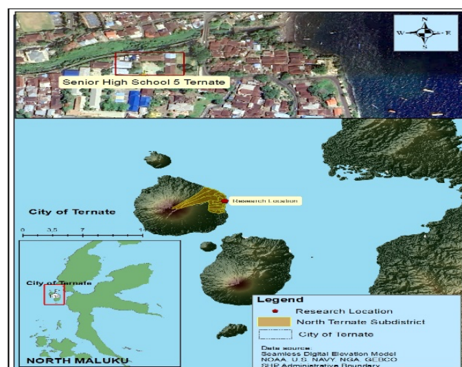
Figure 1: Map of research location

This research was conducted at State High School 5 Ternate City, on Jalan Batu Angus Dufa, Dufa Dufa, Kec. North Ternate City, Ternate City, North Maluku (figure 1), and this research approach uses quantitative research with a Research and Development (R&D) development study type, which refers to the ADDIE development model adopted from Branch (2009) which has components consisting of from the development steps (analysis, design, development, implementation, & evaluation)(Alwan, 2017). This research was carried out in several stages of the 4-D development model, namely a learning device development model with development stages, namely definition (defence), design (design), development (develop) and dissemination (disseminate). Study This use approach is quantitative with type study Research and Development (R&D) development, which refers to the adopted ADDIE development model of Branch (2009), which has the components consisting of steps development (analysis design, development, implementation, and evaluation).