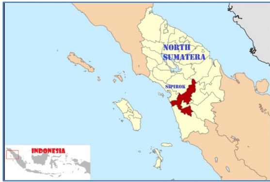
Figure 1. Research locus of Darul Mursyid Boarding School located in the Sipirok district area, North Sumatra – Indonesia