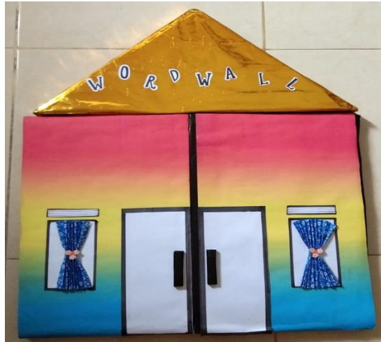
Figure 4.1 Word Wall

Furthermore, the equipments were needed in completing Word Wall such as cards, deeds. Then the researcher designed the cards consisting four kinds of cards. All the cards were designed by using Microsoft word Application in laptop. Those cards are shown the figure below.