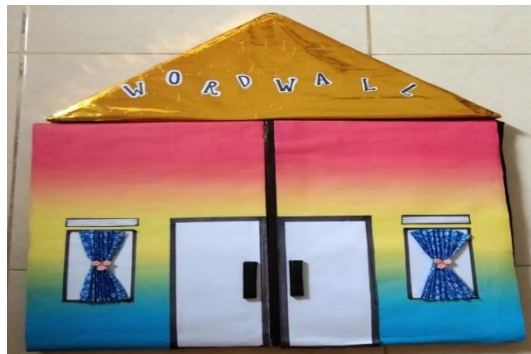
Figure. 4.5 Exterior of Word Wall

Thus, there is difference from between exterior and interior Word Wall. The figures 4.5 below shows the exterior of word wall .