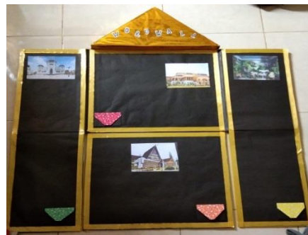
Figures. 4.9 Word Wall

The students play the word wall. The students attempt to write descriptive text based on the instruction given. The players will be asked to write descriptive text when the players get number from the picture. Then the players must discuss with the group to arrange the word from the pocked based on the instructions which almost asked to write personal descriptive text about places in North Sumatera especially in Medan. To be the winner each of groups should fast to finished the word as well. If the group can finished the game as well so the group can be the winner in this section.