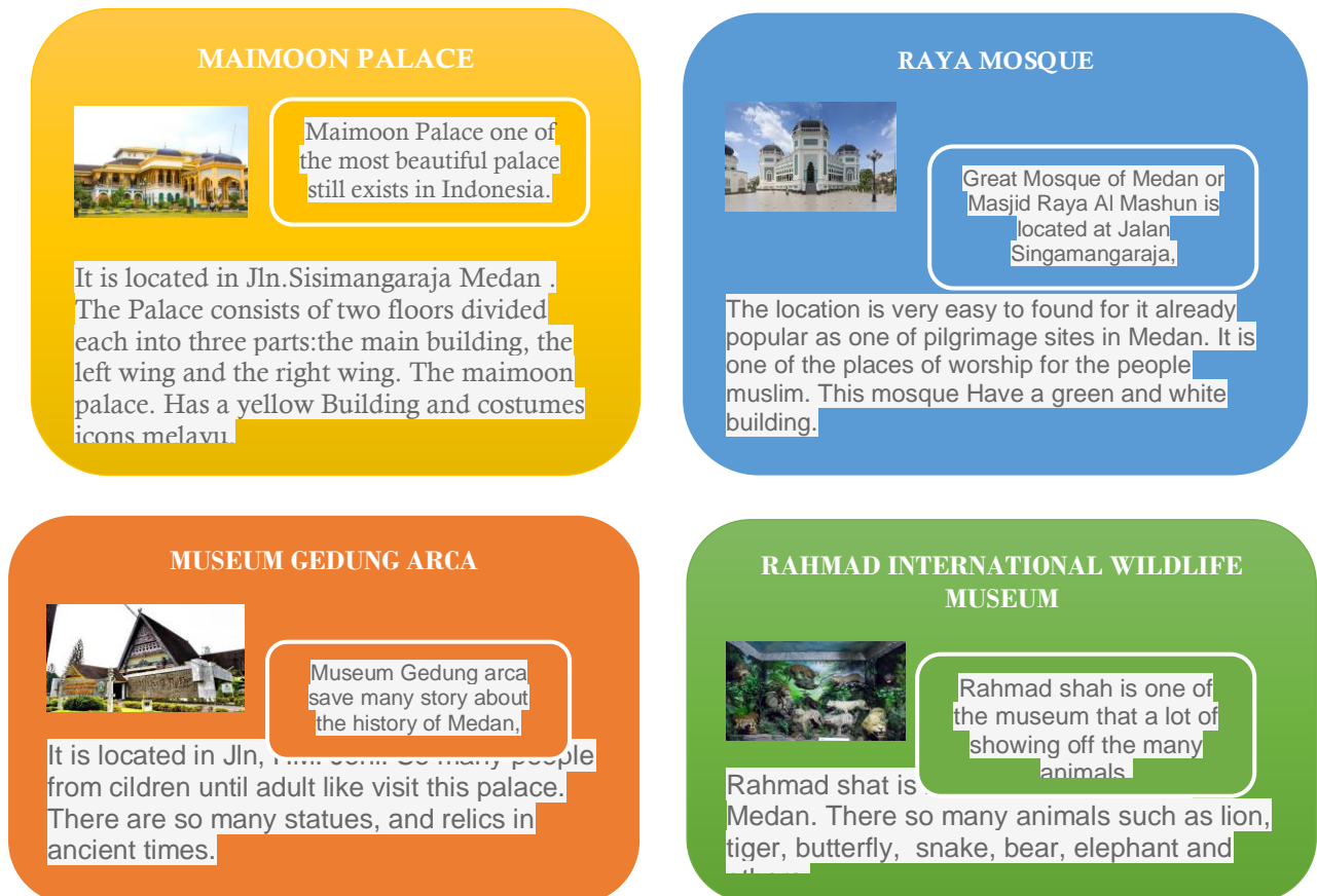
Figure 4.2 Cards of Word Wall

Furthermore, the equipments were needed in completing Word Wall such as cards, deeds. Then the researcher designed the cards consisting four kinds of cards. All the cards were designed by using Microsoft word Application in laptop. Those cards are shown the figure below.