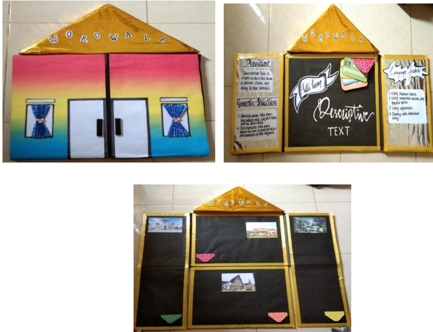
Figures 4.7 Word Wall

The first step of scientific approach was observing. In this step, the teacher shows Word Wall showed the figure 4.7 below in front of the class