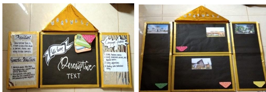
Figures.4.8 explanation and taks of descriptive text

In this step, the students start to play the Word Wall from the first open the house. Then the students see the explanation and information of the descriptive text expecially about the defenition, generic structure and also the language features from the descriptive text. After the students know the explain from the subject, the teacher will opened again, and the students will see the picture inside. The students will take the word in the pocked and should arrange the word based o the picture. The figure 4.8 below shown Word Wall as a playing borad of the students.