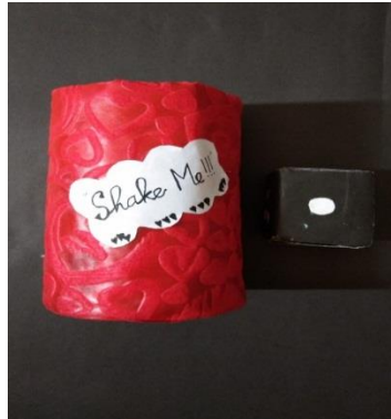
Figure 4.3 The Dice of Word Wall

Furthermore, in playing word wall , it is needed a dice to determine the picture by the group. Therefore, the researcher designed the interesting dice manually by recycling used cardboard. The dice and its media are shown as the figure below.