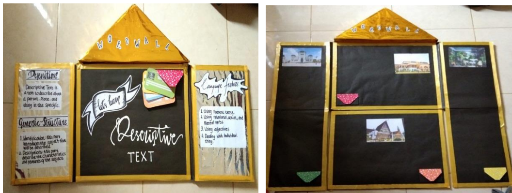
Figure. 4.6 Interior of Word Wall

After opening the house, the Word Wall display becomes flats as board call interior of Word Wall . It has a board card, deed, and picture. It can attract the students' interest by the right color combination. The interior of Word Wall is shown as the figure 4.6 below.