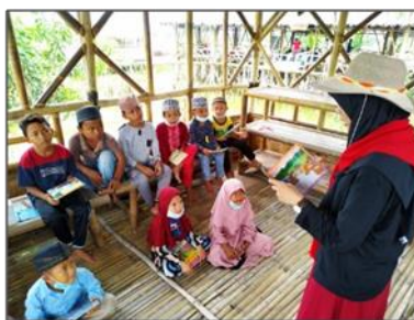
Figure 11. Strengthening Children's Literacy

Literacy strengthening activities in children are assisted by fellow students who are involved in community service activities.