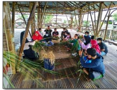
Figure 12. Weaving Assistance

Straw is an organic waste that is very appropriate to be used as a safe working medium so it needs to be developed optimally. Utilization of straw as a medium of expression through the creation of works of art will stimulate children to become creative, imaginative and characterized individuals.