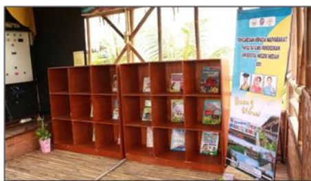
Figure 10. Literacy Room Facilities

The series of service activities were continued by strengthening literacy for children. This is important considering that nowadays children's motivation to read is very low. The literacy room is also equipped with educational books that suit the learning needs of students.