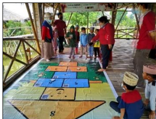
Figure 9. Cyclone Game Simulation

The educational game is equipped with a barcode containing questions about school lessons and also information about tourism in the PematangJohar rice fields.