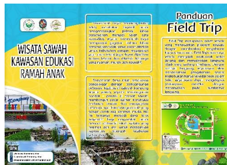
Figure 3. Leaflet Field Trip