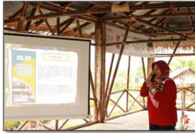
Figure 6. Opening of Mentoring Activities

Furthermore, the mentoring activity was continued with a field trip simulation which was attended by Alfalah Elementary School students in PematangJohar Village. This activity is accompanied by students who are involved in community service activities.