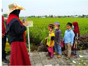
Figure 7. Field trip simulation accompanied by students

Furthermore, the mentoring activity was continued with a field trip simulation which was attended by Alfalah Elementary School students in PematangJohar Village. This activity is accompanied by students who are involved in community service activities.