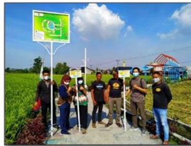
Figure 4. Submission of Service Facilities