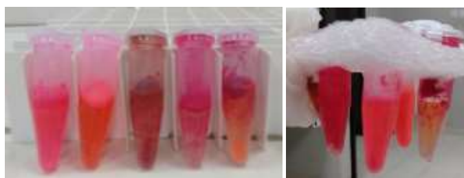
Figure 1. The results of the DNA isolation process of cosmetic samples after being centrifuged (left) and after homogeneous (right)

The first laboratory-scale process carried out is DNA isolation. DNA isolation of lipstick samples has a high level of difficulty considering the complex composition of the lipsticks. Materials that may contain pig DNA in the lipstick composition include glycerin and oil. This makes pig DNA difficult to detect considering the presence of DNA in the material only as a residue. In the DNA isolation process, lipstick samples were very difficult to homogenize and centrifuge. This can be seen in Figure 1. Low purity results in the sample can reduce the quality of DNA and interfere with the success of analysis at a later stage (Abdullah et al. , 2019).