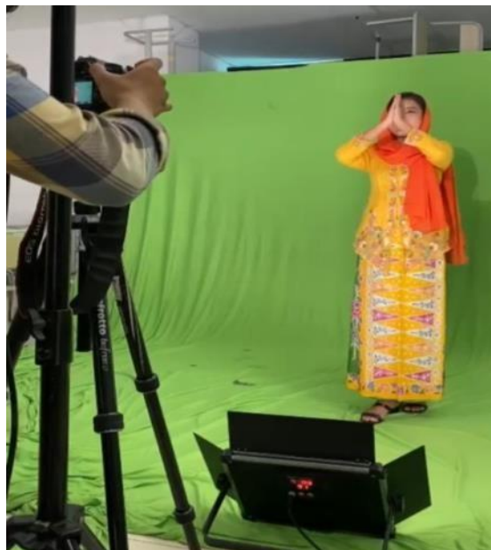
Figure 1. Process of Photographing and Taking Videos 'Salam Betawi Punya Aye'

This initiative not only aims to increase brand awareness but also seeks to create a memorable experience for visitors, fostering a deeper appreciation of Betawi culture. The integration of "Salam Betawi Punya Aye" into the daily activities and promotions of Setu Babakan reflects a strategic effort to position the cultural village as a leading destination for heritage tourism in Jakarta.