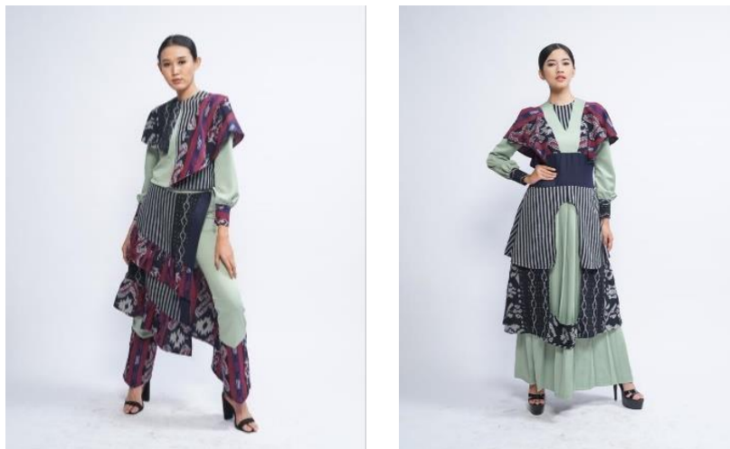
Figure 5. Result of Design 1 and 2

The results of ready-to-wear clothing inspired by the Toraja Rambu Tuka' tradition are as follows: