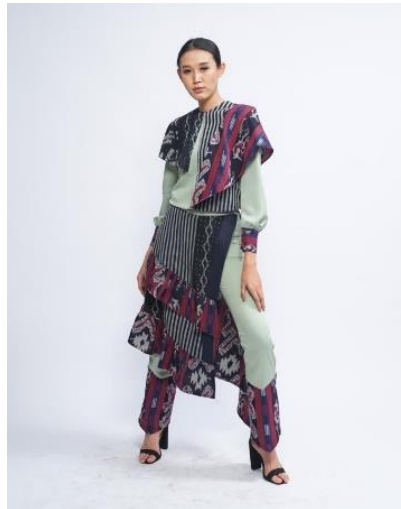
Figure 6. First Design

The second design for Ready to Wear clothing in the Rambu Tuka' collection is women's clothing which consists of just one piece. In the middle of the face of the clothing there is a sharp cut using black Toraja weaving which functions as a clothing decoration. Top sleeves use bishop sleeves. The clothing top uses green Sunkist material and uses black and red Toraja weaving. On the right and left sides of the blouse there are blouse decorations that hang down from the middle of the face and back to the sleeves of the blouse which are cut diagonally using red Toraja weaving. The clothing uses a back zipper opening to make it easier to wear. Next is the bottom of the green clothing with Sunkist material which is made like a plisket skirt. At the bottom of the clothing above the plisket skirt there is fabric that is made like a skirt with fabric that is piled up or tiered but does not cover the plisket skirt. The middle of the front of the clothing is cut like a circle, while the back is a flat black piece made from Toraja woven fabric.