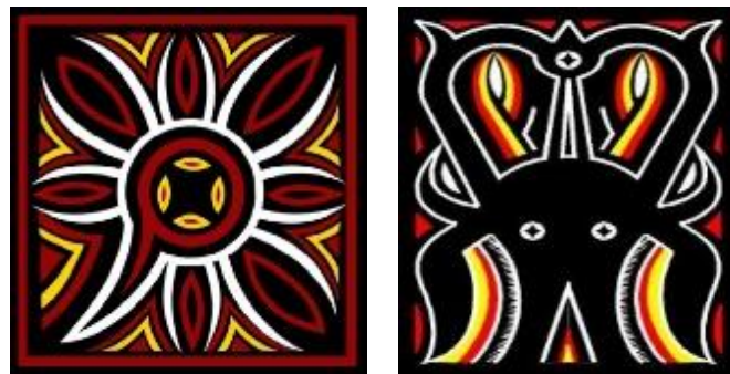
Figure 3. Toraja Weaving Motifs

This decoration means prosperity for the people and is a sign of prosperity because they have the ability to raise buffalo. Apart from that, by adding Pa'Erong decorations, the philosophical value is also found that those who use these decorations are smart and wise people. In the author's creative process, the development of form is also linear with the philosophy believed by the community. The application of this decoration does not go through a stylization process, but the size of the motif will change to suit the overall design.