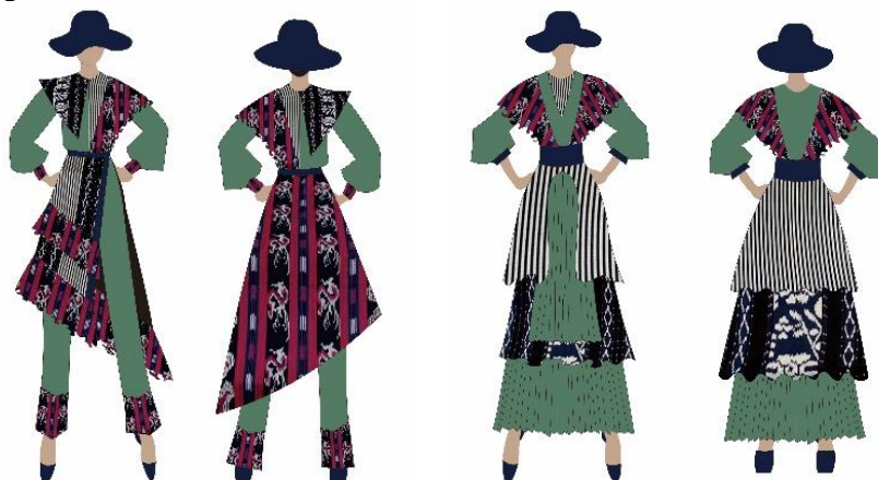
Figure 4. Design 1 (left) and Design 2 (right)

The deliver stage is the final stage, at this stage you will see the finished results of applying the Rambu Tuka' tradition to making Ready To Wear clothing. In creating a fashion work there are several stages, namely 1) Determining the source of the idea in the form of a moodboard. 2) Determine the target market, namely for whom the work will be created. 3) Create a design that will be realized, following is a picture of the design that will be realized. 4) Prepare materials and tools. 5) Make a tool to find out the location of the decorations that will be applied. 6) Evaluation on first fitting. 7) Cutting the actual material. 8) Sew the actual material.