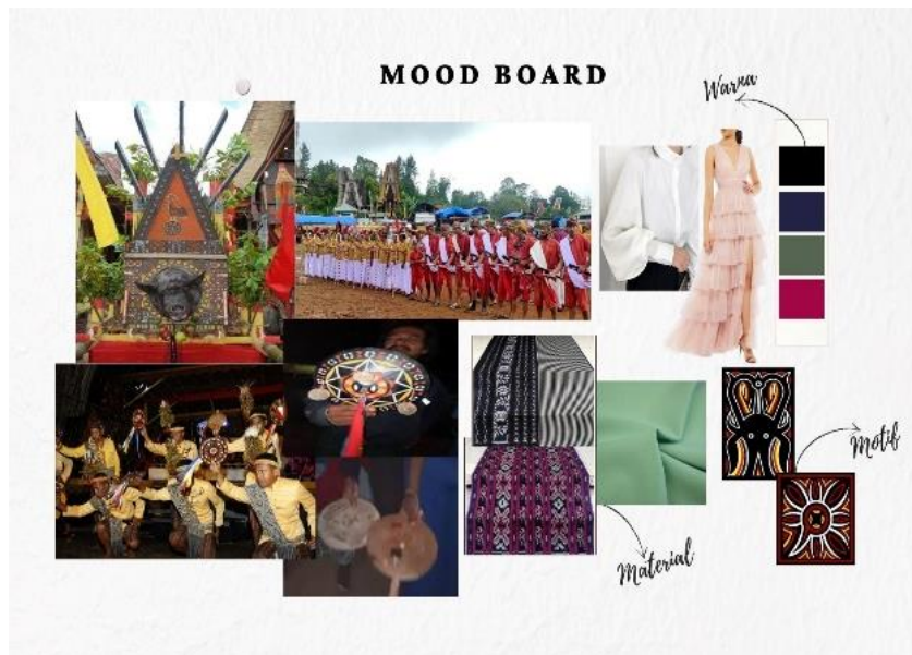
Figure 2. Moodboard

This party fashion work was inspired by the Toraja tradition, namely Rambu Tuka'. The display of Tuka Signs has been carried out by the Torajan people for generations. What is unique about the implementation of Rambu Tuka' is that Toraja people wear different clothes but have typical Toraja cloth, namely woven cloth. Toraja Woven Cloth is cloth that comes from the native Toraja people. From this tradition, several color schemes were chosen to be applied in fashion works, taking the colors green, black and red.