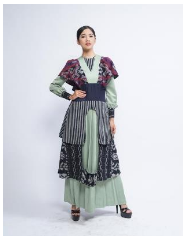
Figure 6. Second Design

The second design for Ready to Wear clothing in the Rambu Tuka' collection is women's clothing which consists of just one piece. In the middle of the face of the clothing there is a sharp cut using black Toraja weaving which functions as a clothing decoration. Top sleeves use bishop sleeves. The clothing top uses green Sunkist material and uses black and red Toraja weaving. On the right and left sides of the blouse there are blouse decorations that hang down from the middle of the face and back to the sleeves of the blouse which are cut diagonally using red Toraja weaving. The clothing uses a back zipper opening to make it easier to wear. Next is the bottom of the green clothing with Sunkist material which is made like a plisket skirt. At the bottom of the clothing above the plisket skirt there is fabric that is made like a skirt with fabric that is piled up or tiered but does not cover the plisket skirt. The middle of the front of the clothing is cut like a circle, while the back is a flat black piece made from Toraja woven fabric.